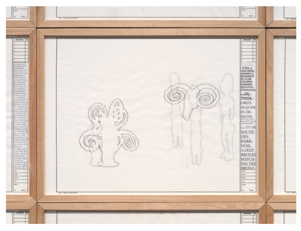
Terry Adkins, "Audience (from Belted Bronze)," detail

Installation view of Terry Adkins, "Audience (from Belted Bronze)" (2007-8), 28 framed drawings, 5 plastic milk crates and taxidermy peacock; each frame: 19 1/4 x 25 1/4 x 1 1/2 inches; overall: 77 x 177 x 1 1/2 inches, 84 1/2 x 31 x 24 inches