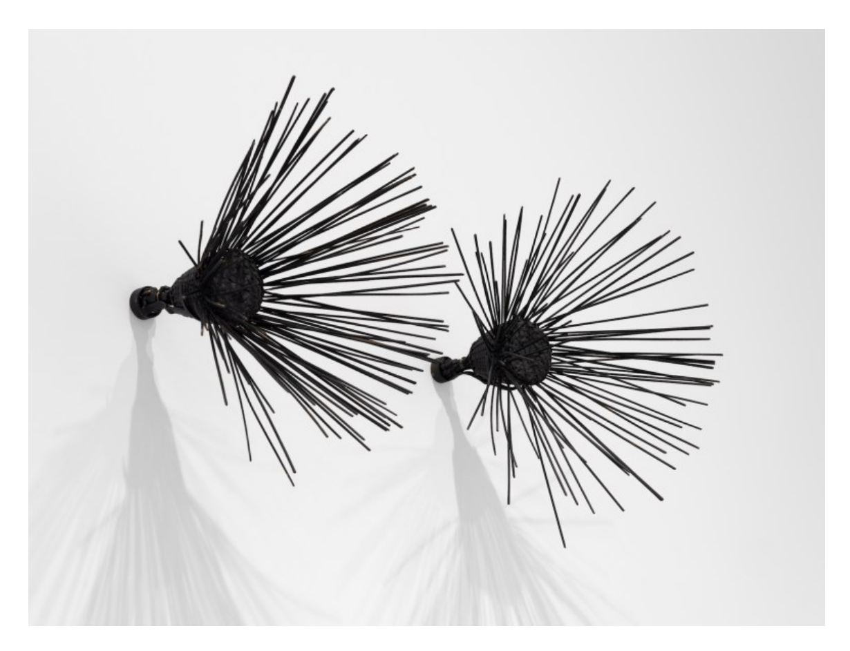
Terry Adkins, "Pine" (2003), rattles and incense; each: 18 x 18 x 16 inches

Volk, Gregory. "Terry Adkins' Objects of Wonder," Hyperallergic, May 29, 2022