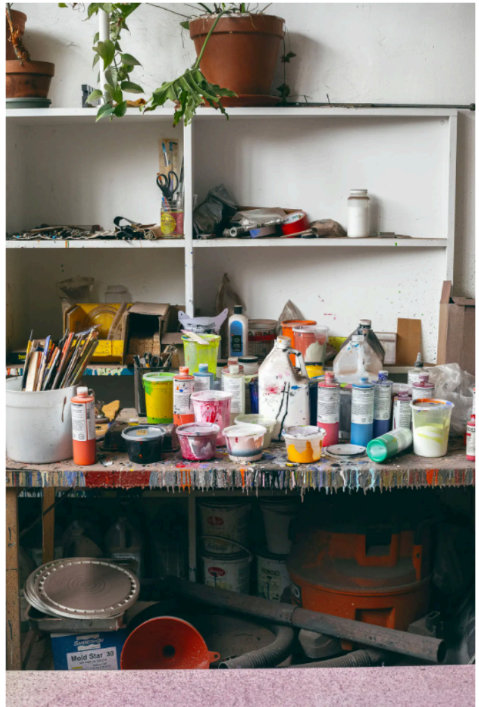
Assorted paints in the spray-painting room.