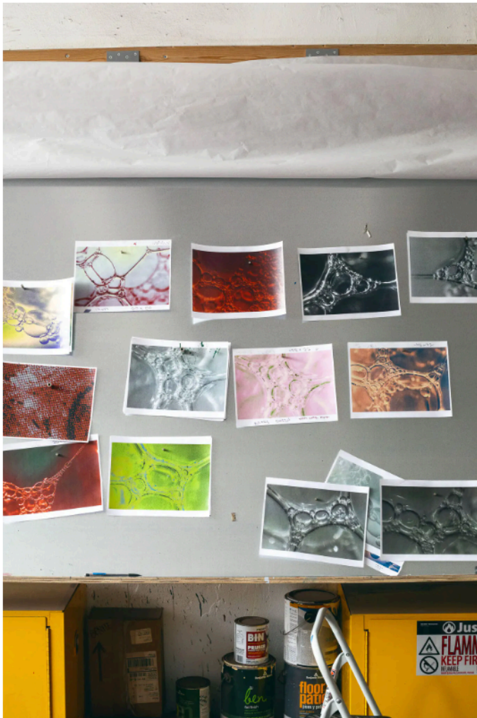
In the front room, printouts of digitally altered photographs of soap foam taken under a microscope. Auerbach processes the images to add color, then copies them onto spray-painted Dibond panels using a projector and a system of pointillist dots. Melody Melamed

Felsenthal, Julia. "An Artist Whose Work Might (Possibly) Have Its Own Free Will," T: The New York Times Style Magazine , March 16, 2023, https://www.nytimes.com/2023/03/16/t-magazine/tauba-auerbach-art.html .