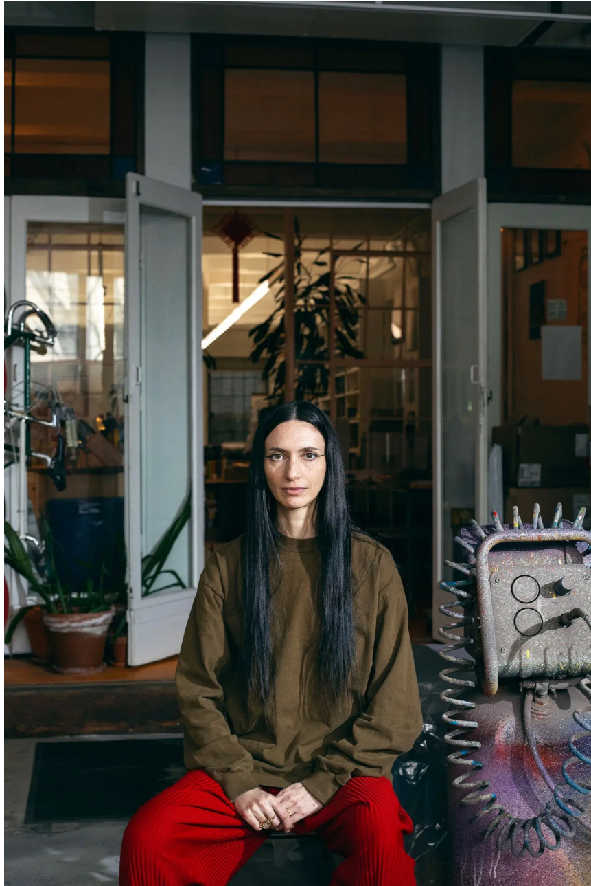
The artist Tauba Auerbach in their studio on New York's Lower East Side.

Tauba Auerbach's brilliant, mathematical paintings and sculptures exist in what they call a "scary place of unknowns."