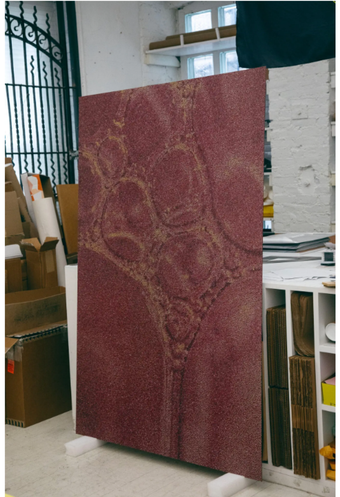
Auerbach's painting "Foam" (2023), shown on its side. Melody Melamed