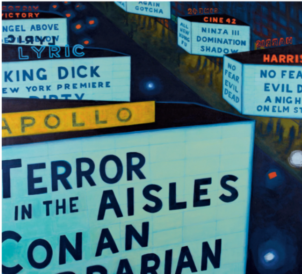
Jane Dickson, Big Terror , 2020, acrylic on linen, 65 × 73".

https://www.artforum.com/print/reviews/202206/jace-clayton-on-the-whitney-biennial-2022-88620