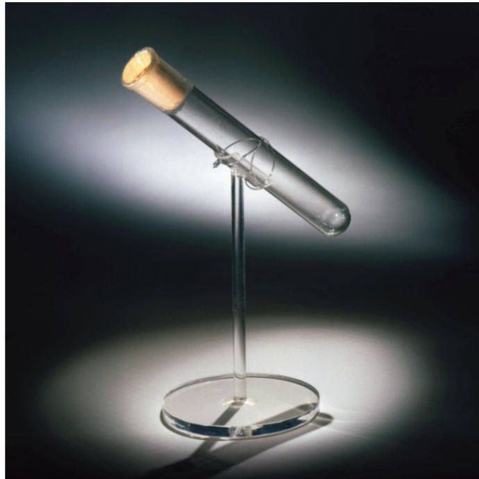
Thomas Edison's last breath, 1931, glass, paraffin, cork, 6 x 3/4 x 3/4".