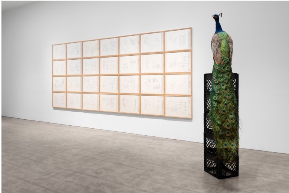
Installation view of Terry Adkins, "Audience (from Belted Bronze)" (2007-8), 28 framed drawings, 5 plastic milk crates and taxidermy peacock; each frame: 19 1/4 x 25 1/4 x 1 1/2 inches; overall: 77 x 177 x 1 1/2 inches, 84 1/2 x 31 x 24 inches

Volk, Gregory. "Terry Adkins' Objects of Wonder," Hyperallergic , May 29, 2022