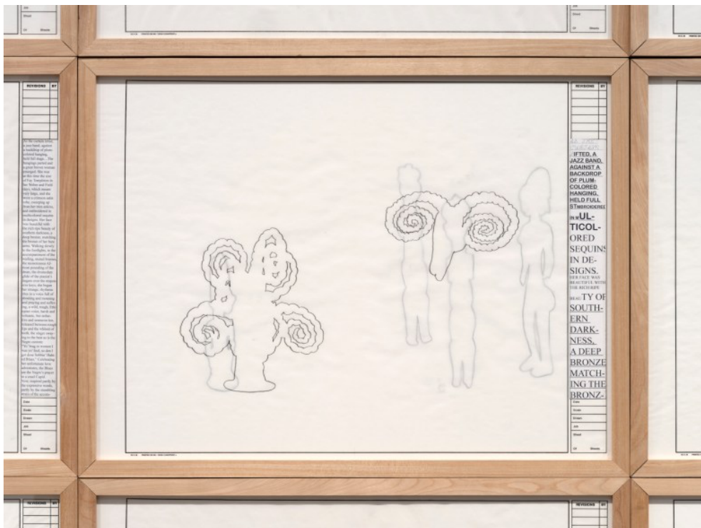
Terry Adkins, "Audience (from Belted Bronze)," detail