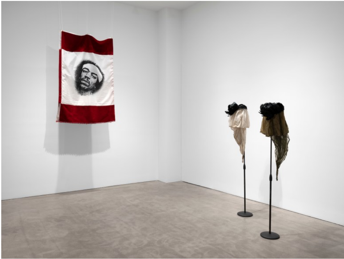
From left: Terry Adkins, "Hendrix Flag" (2012), velvet with silkscreen on polyester, 43 x 80 inches; Terry Adkins, "Barchiel" (2012), microphone stand, parachute, and dyed feathers, 70 x 17 1/2 x 15 inches; Terry Adkins, "Adnachiel" (2012), microphone stand, wooden dowel, parachute and dyed feathers, 79 3/4 x 12 x 12 inches

Volk, Gregory. "Terry Adkins' Objects of Wonder," Hyperallergic , May 29, 2022