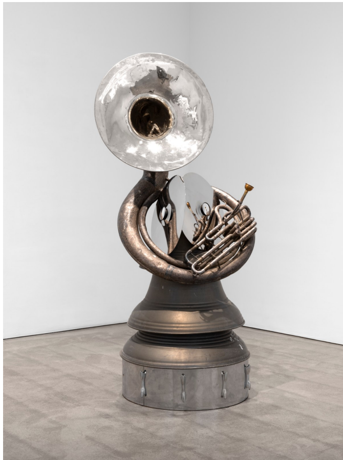
Terry Adkins, "Mrs. Brown" (2010), sousaphone, aluminum bells, and silver drum with drum head, 74 ¼ x 30 x 30 inches (all images © 2022 The Estate of Terry Adkins / Artists Rights Society (ARS), New York. Courtesy Paula Cooper Gallery, New York. Photos by Steven Probert)