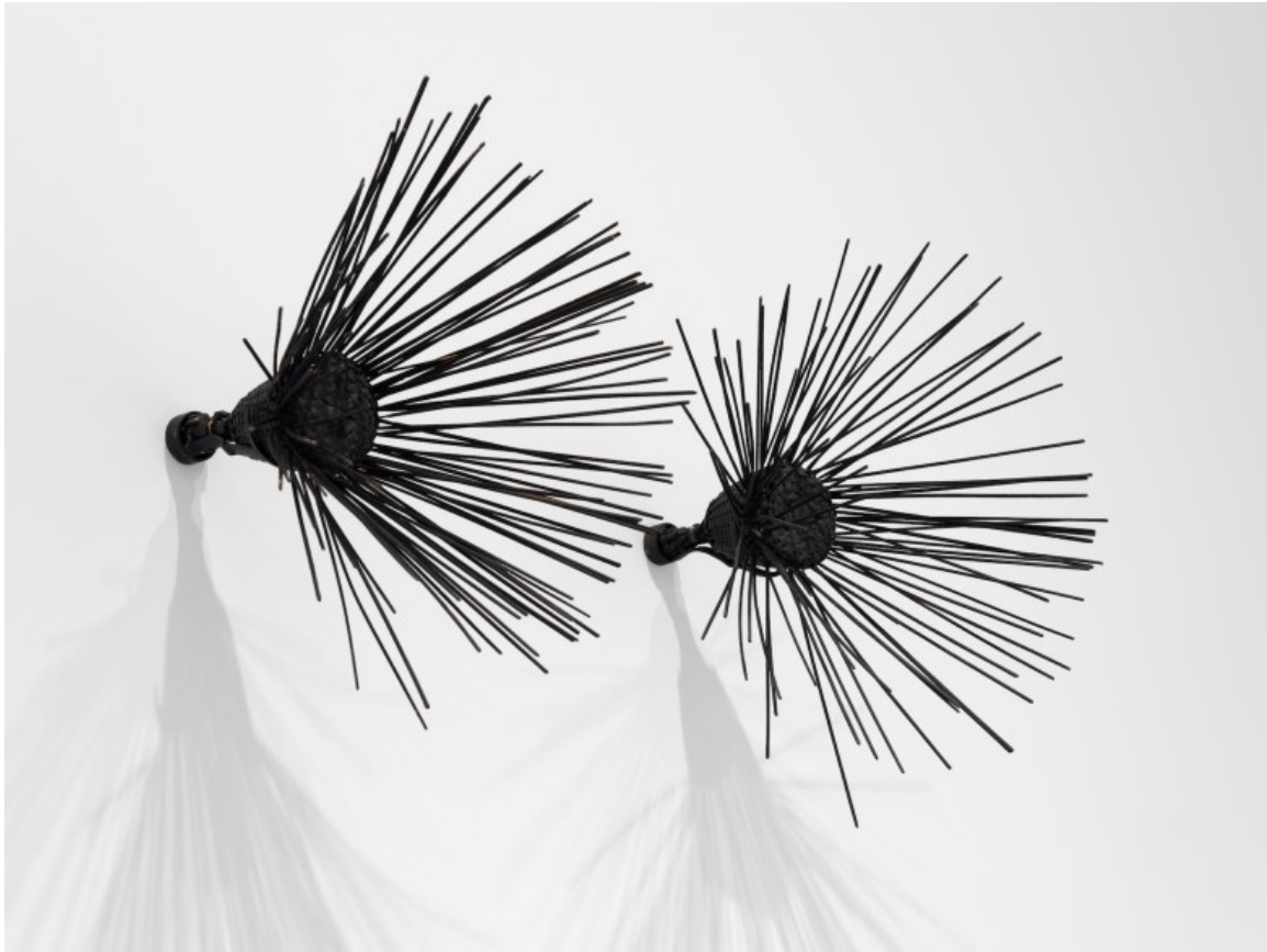
Terry Adkins, "Pine" (2003), rattles and incense; each: 18 x 18 x 16 inches

Volk, Gregory. "Terry Adkins' Objects of Wonder," Hyperallergic , May 29, 2022