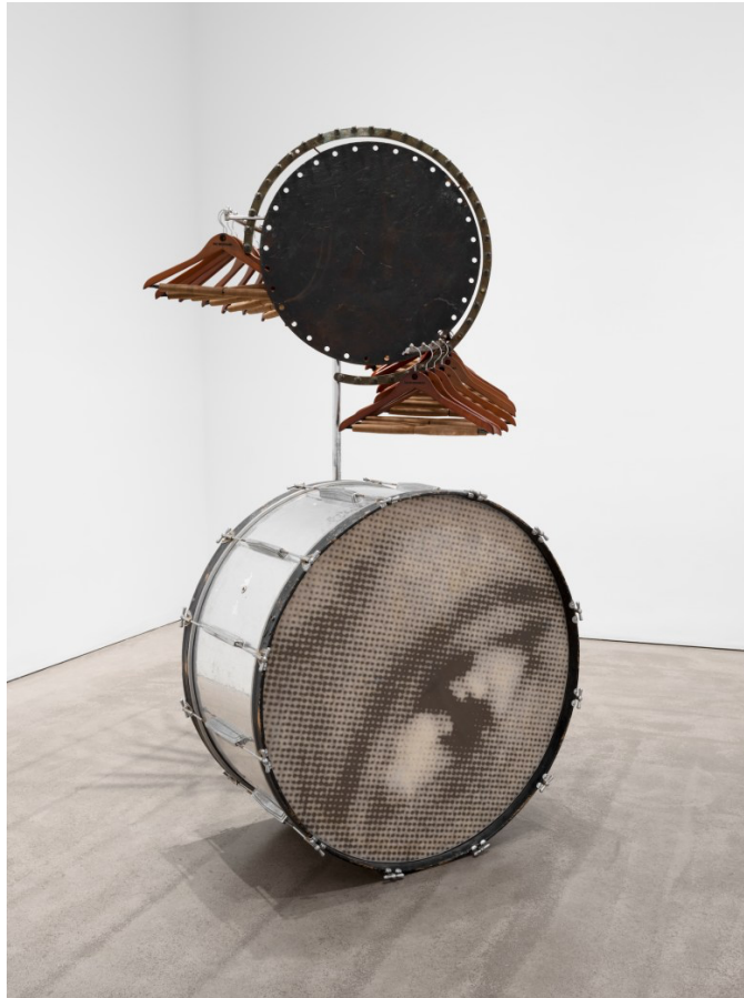
Terry Adkins, "Matinee" (2007-13), brass drum with image, steel armature, welded bronze, 28 hangers-burnt cork

Volk, Gregory. "Terry Adkins' Objects of Wonder," Hyperallergic , May 29, 2022